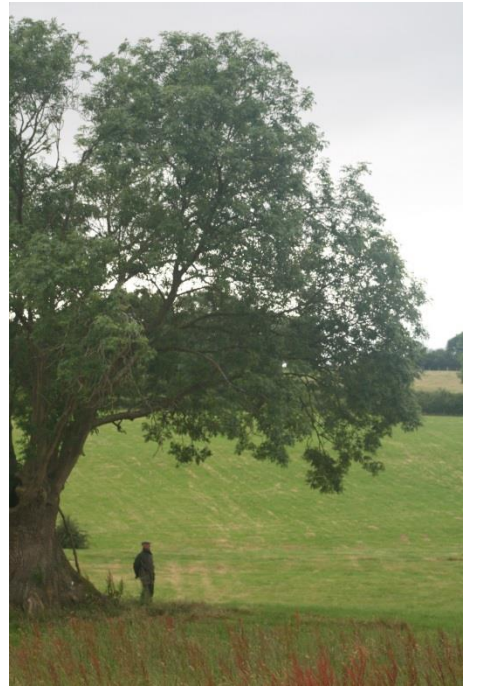
A day of dummy throwing can be peaceful!