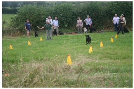
"Anyone say there was a sausage on offer?"