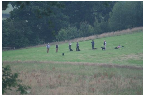
Team "Remington" at Richard's test