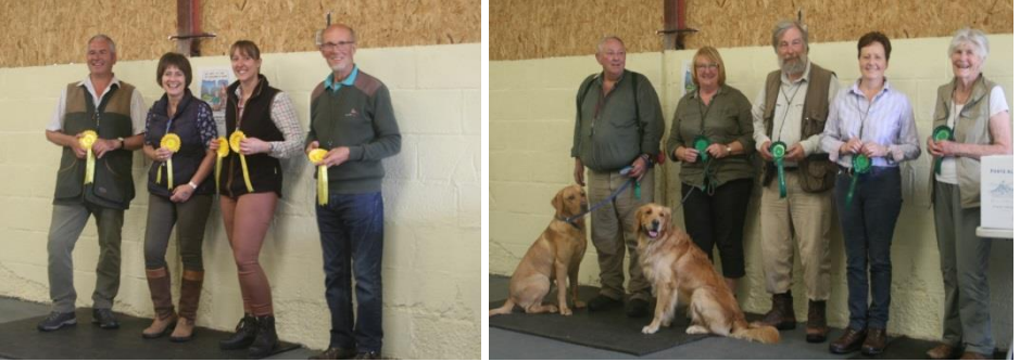
3<sup>rd</sup>: Team "Remington"