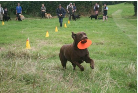
Trust a "Chocolate" to put the F in Fun!!!